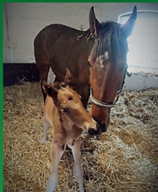
Our 2017 ICSI Foal : Twemlows Gilbert

These advanced techniques offer an alternative route to breed mares similar to IVF in humans, ideal for mares suffering chronic endometrial problems and ovulation failure.